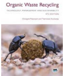
Organic Waste Recycling: Technology, Management and Sustainability – 4 th edition

“The popularity of the book is attested by the fact that after its first edition in 1989, it is now under its fourth edition,”