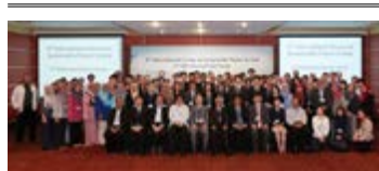
The 3 rd International Forum on Sustainable Future in Asia (3 rd NIES Forum)